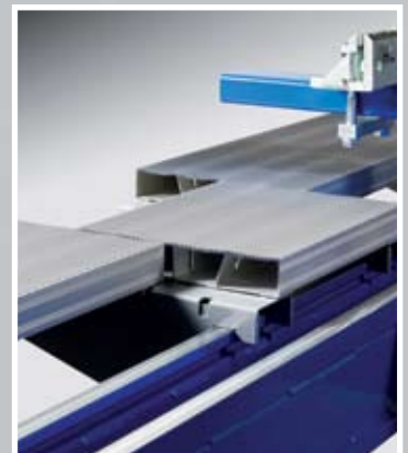
Timesaving and ergonomic Allows access to the damage areas of the vehicle, anchoring points, and adjustable platforms to reach upper body areas