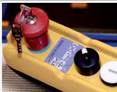
User-friendly hand control with all-in-one controls for automatic tilting, lifting, pulling and hydraulic pillar jacks.