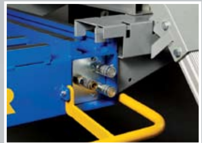
Easy to handle; multifunctional power unit and central satellite locations for hydraulics and air hook ups.