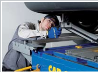
Quick and efficient Structural diagnosis while vehicle is supported on it's wheels or in a clamped position.