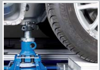
Effective holding and clamping Does not require dedicated vehicle specific fixtures when using EVO1-3 for holding, anchoring and fixturing