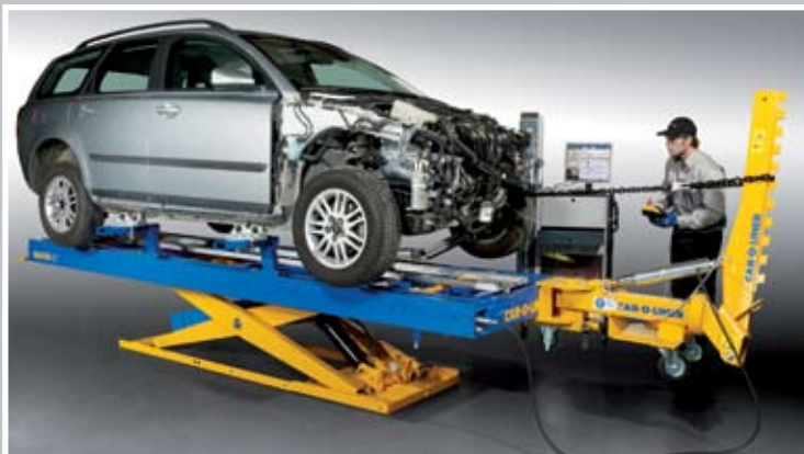
Quality assured repairs with accurate measuring in real time through the entire repair process by Car-O-Tronic.