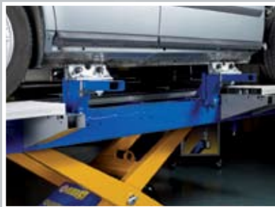
Quick and secure clamping directly when the vehicle is on its wheels or in a clamped loaded position.