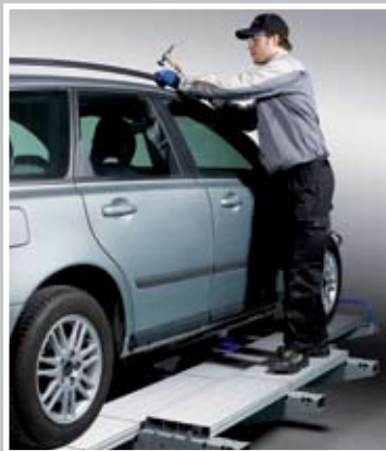
Easy access; lightweight multi-purpose ramps, for wide and narrow wheelbases.